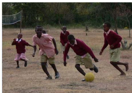
Living Way youth enjoying soccer