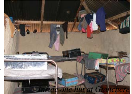
Inside one hut at Gianchere

At Gianchere School for the Deaf in Keumbu, Kenya, students sleep 3-4 per bunk bed in mud huts. On September 22, 2007, Utengo will embark on it's next school project by hosting its first golf classic to help build a dormitory for Gianchere. All skills are welcome to the beautiful City Club Marietta Golf Course near the Marietta Square. There is also a full range of sponsorship