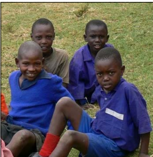
Bugo Primary School students

As funds become available, Utengo hopes to provide three more schools in the region with these vital water tanks.