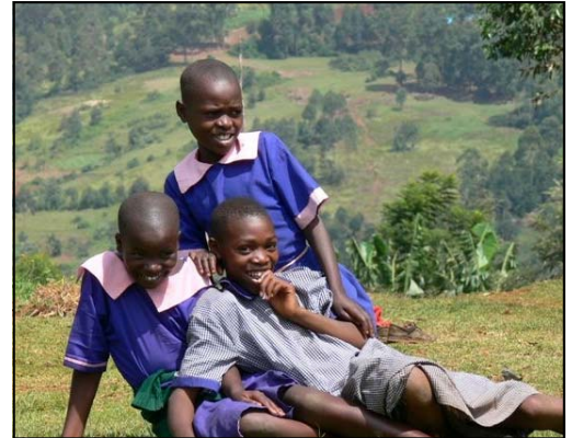
Ritaro Primary School students

As drought cripples fresh water supplies, cholera, a deadly water-born disease, has sickened thousands. The disease is spread when a water supply is contaminated by the feces of an infected person. Cholera is 100% preventable when clean water is available. Your contributions fund much needed storage tanks, which provide safe, filtered rainwater to hundreds of families each year.